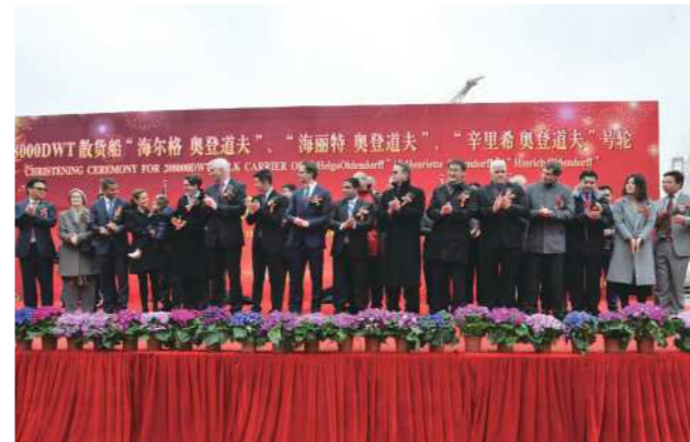
Naming ceremony of three 208,000DWT Newcastlemax Bulk Carriers for Oldendorff Germany dated January 2016.