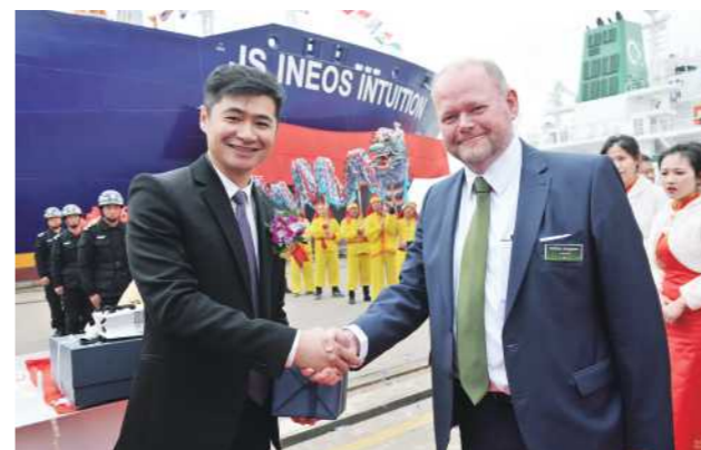
Delivery of two 27,500m³LNG Carrier for Evergas dated March 2017.