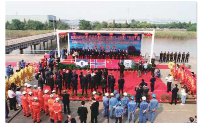
Naming Ceremony of the first 83,500DWT Cleanbu in the world for Klavness Norway dated October 2018.