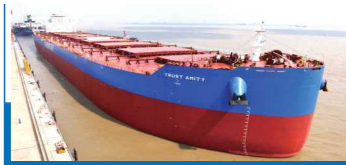
208,000DWT Newcastlemax Bulk Carrier