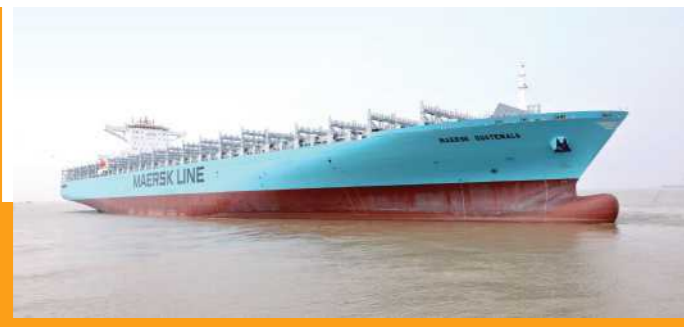
10,000TEU Container Vessel