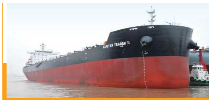
82,000DWT Kamsarmax Bulk Carrier