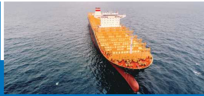
11,800TEU Container Vessel