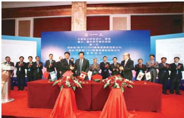
Contract signing ceremony of 7 firm + 18 option 10,000TEU Container Vessels with Seaspan dated June 2011.