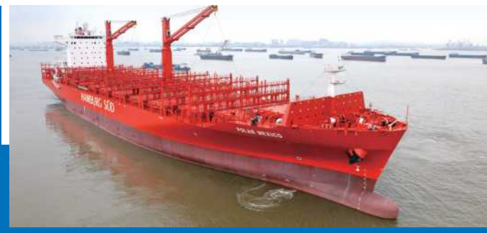
3,800TEU Container Vessel