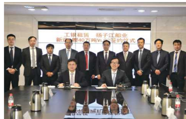
Contract signing of 6 firm 400,000DWT VLOC in Beijing with ICBC Leasing dated April 2016.