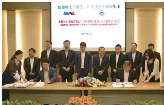
Contract signing ceremony of 8 firm 11,800TEU container vessels with PIL dated September 2015.