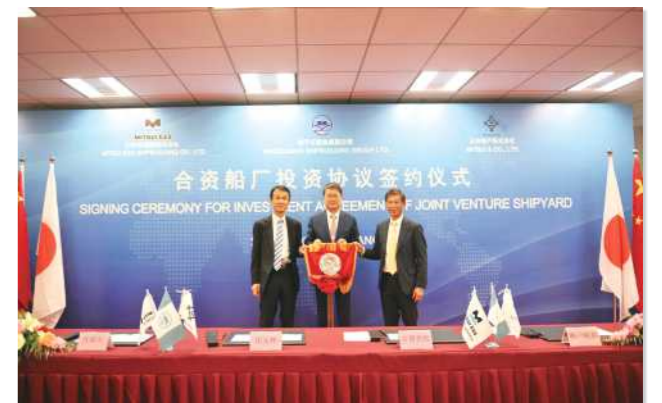
Joint venture shipyard cooperation agreement with MITSUIE&S SHIPBUILDING and MITSUI & CO. signed in October 2018.