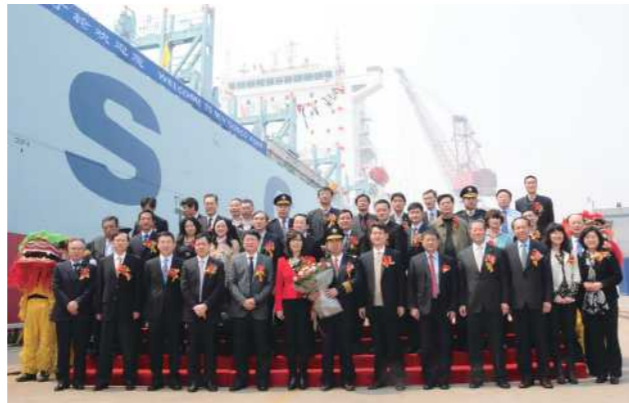
Delivery & Naming ceremony of the 100th vessel by New Yangzi dated March 2012.