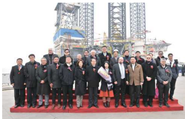
Naming ceremony of the first Jack-up dated January 2016 in Taicang city.