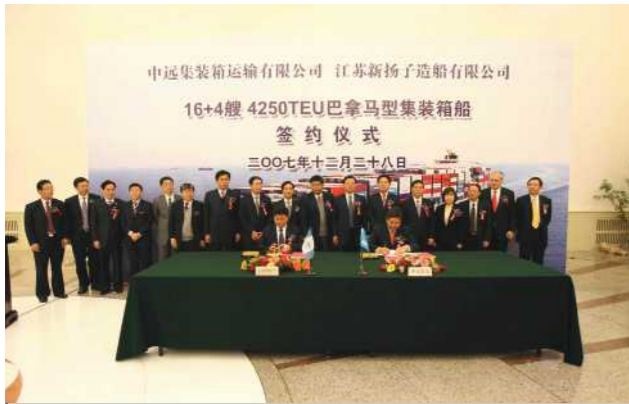
Contract signing ceremony of 16 firm + 4 option 4,250TEU Panamax Container Vessels with COSCO dated December 2007.