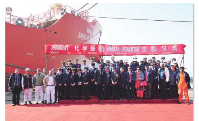
First 39,000DWT Product oil Tanker for Bangladesh Shipping Corporation delivered dated January 2019.