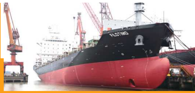
1,800TEU Container Vessel